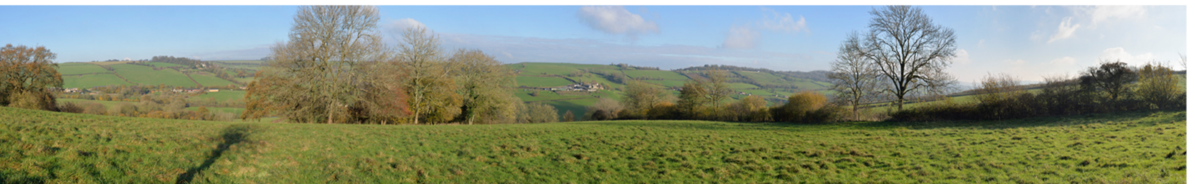
View from the east end of the Long Barrow today from the north to the south looking over the Woolley Valley. The City of Bath and Little Solsbury Hill Camp lie at the southern end of the valley.

Trying to produce an isometric view with only 12 views through the 'long barrow' is problematic enough using static means, as shown. It is for this reason that we have had to look at dynamic ways of viewing the material, as per the slide show on the screen.