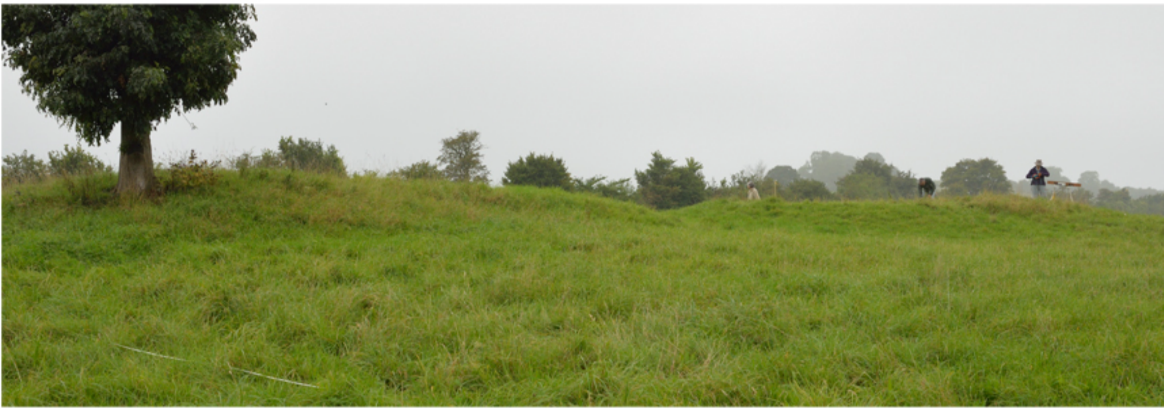
Barrows from the northeast during profiling. The Round Barrow is on the right.